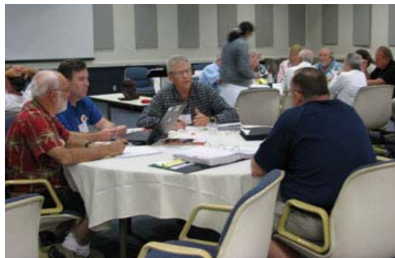
Mid year Planning with the FL Host Teams

God says: I will never leave you or forsake you (Hebrews 13:5)