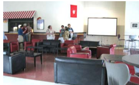
Student's Events Room