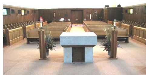
Cor Jesu Chapel