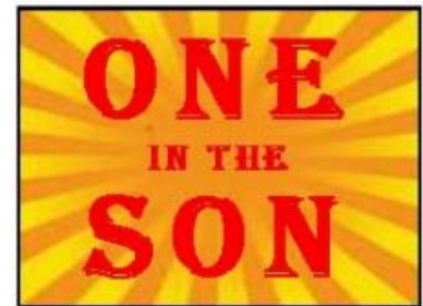
NLS FLORIDA 2009