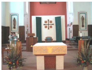
BARRY UNIVERSITY Chapel